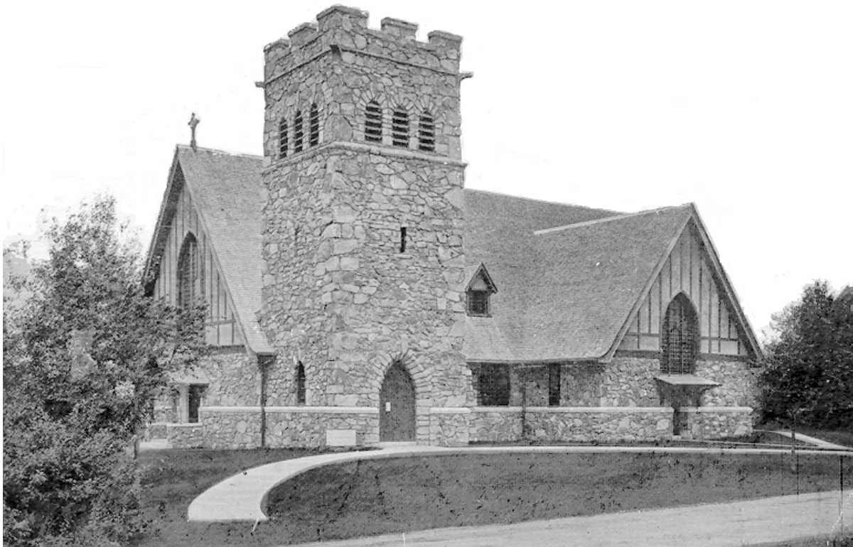
Trinity Episcopal Church, York Harbor, Maine, circa 1908