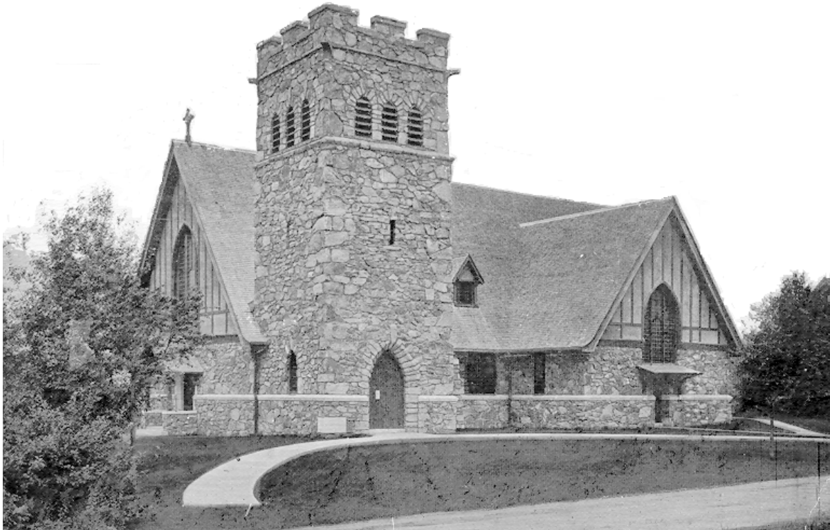
Trinity Episcopal Church, York Harbor, Maine, circa 1908