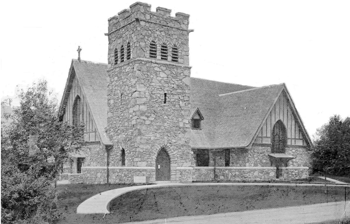
Trinity Episcopal Church, York Harbor, Maine, circa 1908