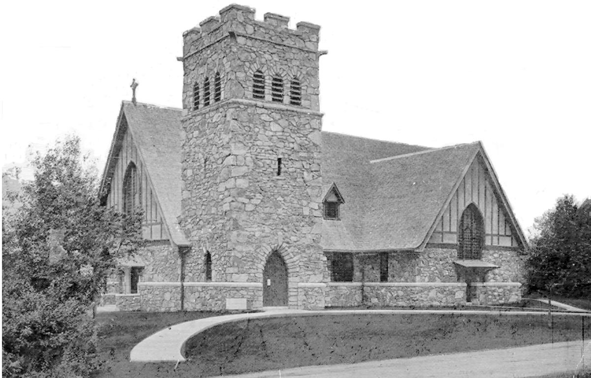
Trinity Episcopal Church, York Harbor, Maine, circa 1908