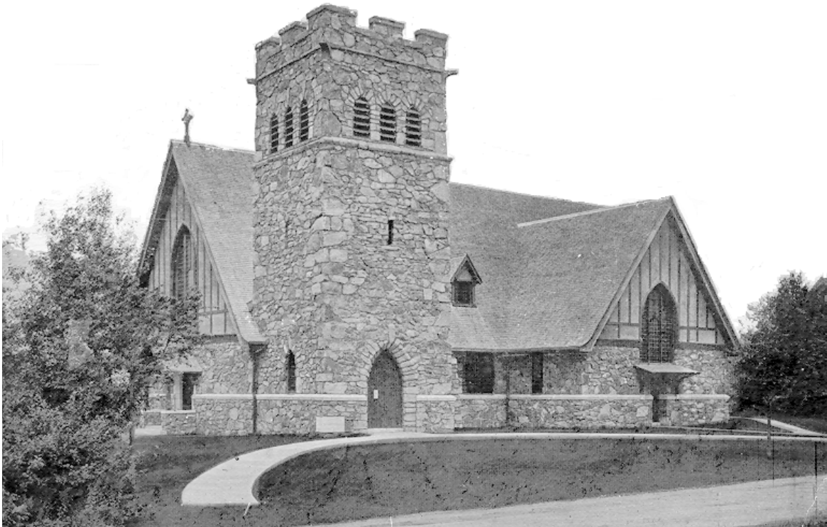
Trinity Episcopal Church, York Harbor, Maine, circa 1908