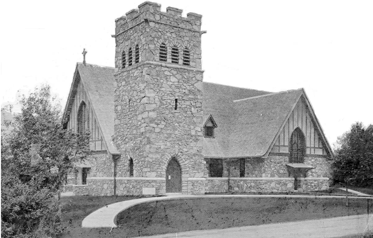
Trinity Episcopal Church, York Harbor, Maine, circa 1908