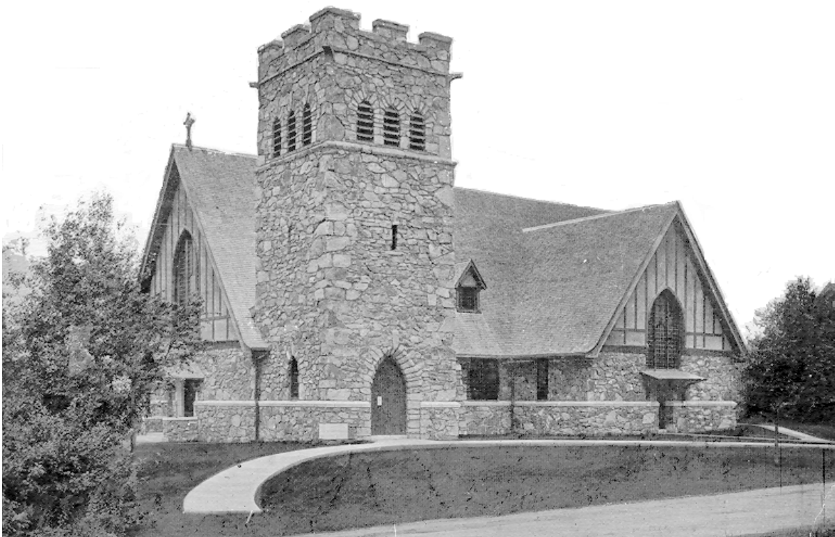
Trinity Episcopal Church, York Harbor, Maine, circa 1908

Assistive listening devices available; please ask an usher if you would like one.