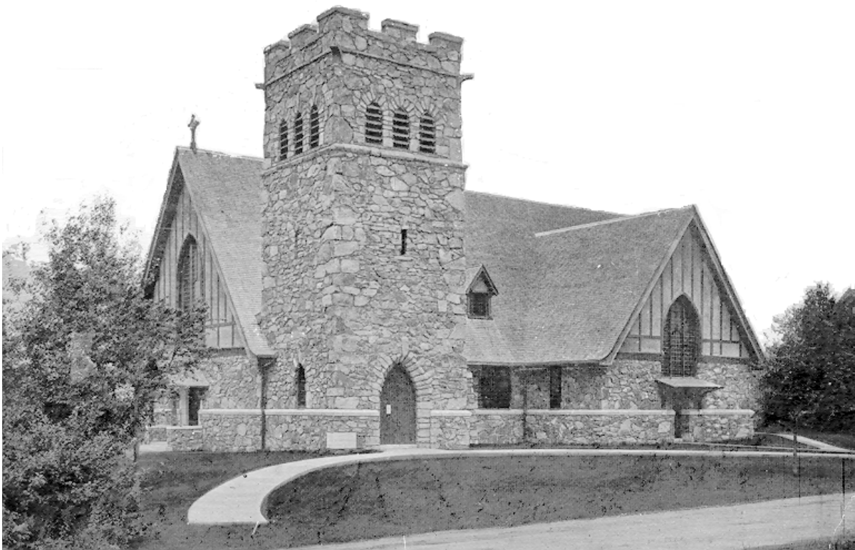
Trinity Episcopal Church, York Harbor, Maine, circa 1908