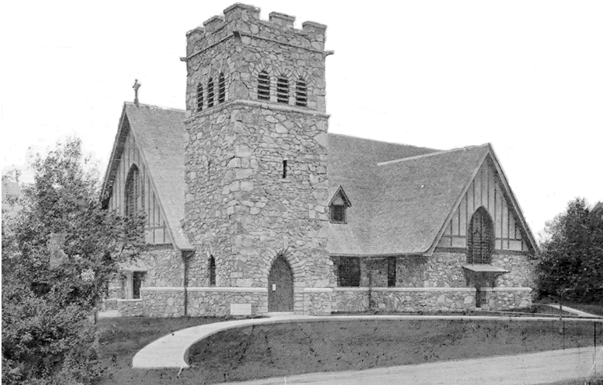
Trinity Episcopal Church, York Harbor, Maine, circa 1908