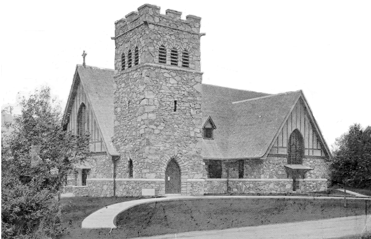
Trinity Episcopal Church, York Harbor, Maine, circa 1908

Assistive listening devices available; please ask an usher if you would like one.