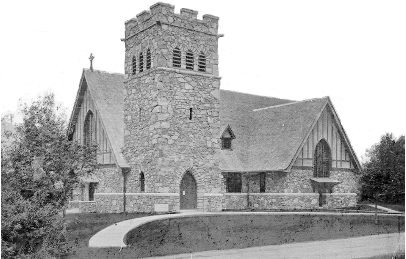
Trinity Episcopal Church, York Harbor, Maine, circa 1908